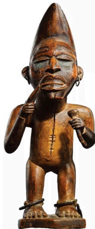
▲ Among the principal exhibits with Brussels tribal-arts dealer Didier Claes is a Nkisi figure from the Kongo Yombe people of the DRC. At 11½in high, it is made of wood, mirror and metal with traces of pigment. Such figures were used in oath-taking, much like Bibles in court. It was collected during the first decade of the 20th century by a Belgian administrator. →