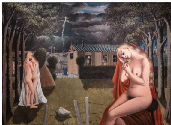
▲ De Jonckheere was founded in Brussels in 1976 and moved to Paris before settling in Geneva, Switzerland, but the gallery continues to specialise in Flemish and Belgian paintings. It is showing a typically eerie Paul Delvaux, the 42½in by 59in The Storm , 1962, which was once in the distinguished Nellens Collection at Knokke.